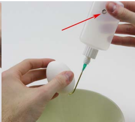
Fig 5 Remove your thumb from the hole to draw air into the bottle without sucking the egg into the tube.