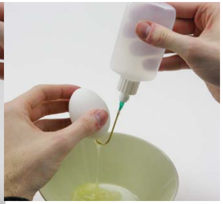
Fig 6 Then place your thumb over the hole and gently squeeze the bottle again.