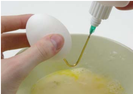
Fig 13 Rinse the remainder of any egg remnants by gently squeezing water into the egg. Remember not to force more water in than can exit around the syringe or you will crack the egg.

After rinsing the egg give the bottle a gentle squeeze to flush out any water in the syringe.