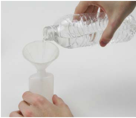
Fig 10 When you have removed as much egg as possible, fill bottle #2 with water.