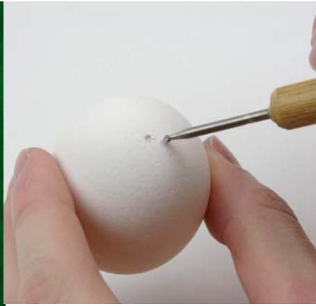
Fig 2 Use the included drill with a twisting motion to slowly drill into and through the egg shell.