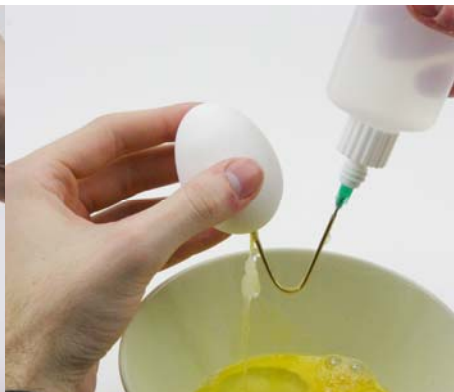
Fig 8 If you don't see any yolk, then use the paper clip again to break and stir the yoke, then repeat the squeezing.