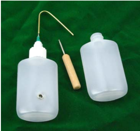
Fig 1 Contents of the kit. 1. bottle for squeezing air 2. bottle for rinsing with water. The syringe cap fits both bottles. 3. egg drill