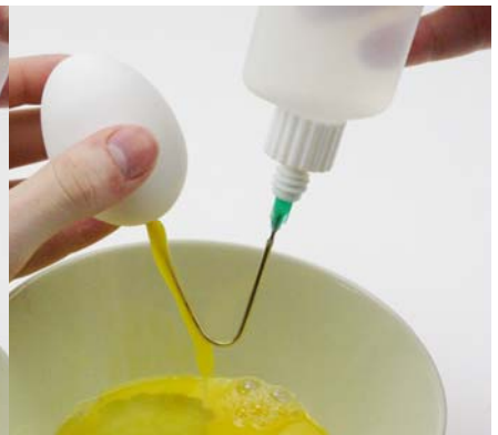
Fig 9 Squeeze by blocking the hole with your thumb, then release your thumb to draw air back into the bottle.