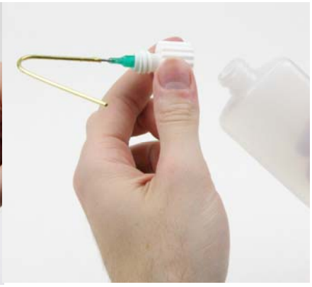
Fig 12 and screw it onto bottle #2.