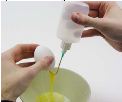
Fig 7 Continuing squeezing and releasing the bottle until all or most of the egg has been removed.