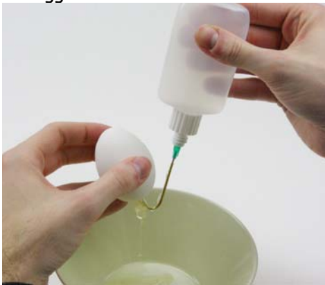
Fig 4 Using bottle #1, insert the tubing into the hole in the egg and gently squeeze the bottle with your thumb closing the hole